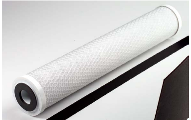
Exclusive Replacement Carbon Filters