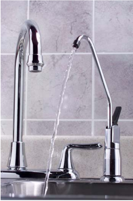
Custom Air Gap Faucet