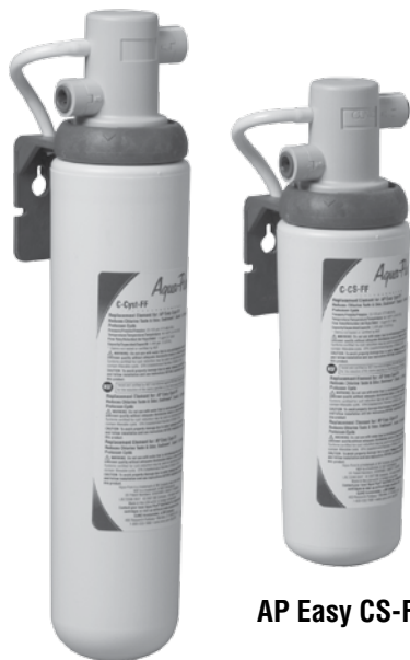
AP Easy CS-FF