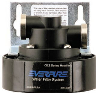
QL2 Single Head: EV9272-18

Filter head exclusively for Everpure replacement cartridges