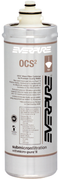
OCS 2 Replacement Cartridge: EV9618-02

Delivers premium quality water for office coffee applications