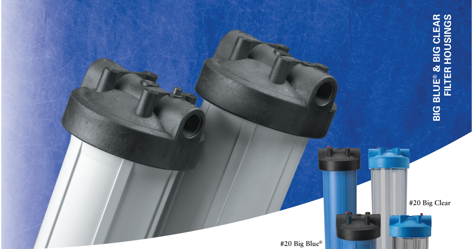
#20 Big Blue®